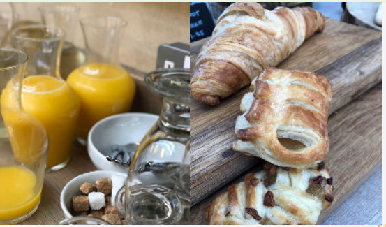
Long's Breakfast, £9 per person *Minimum of 4 people

All our catering is freshly prepared to order by our in house catering team. Vegan, Gluten Free and Dairy Free options available upon request.